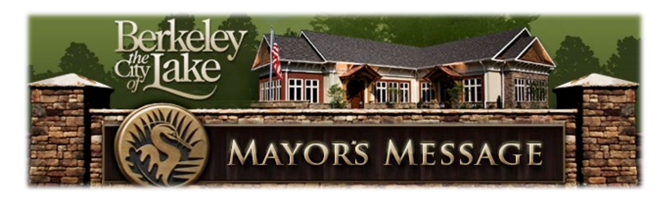
September 9, 2022

As you know this time of year I am always preparing to appoint people to city committees , which happens at the beginning of each year. If you are interested in serving on the Berkeley Lake Conservancy, the Planning and Zoning Commission, or the Citizens Finance Committee, please let me know. There may be an opening coming up. The involvement of people who are so generous in volunteering their time is one of the major strengths of our city.