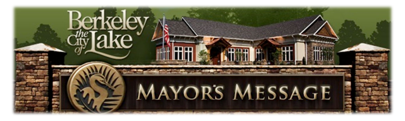
November 3, 2021

There's a lot going on this weekend in our city. On this Saturday, November 6 from 10 AM until 3 PM there will be a Holiday Market at Pinckneyville Park Community Recreation Center , 4650 Peachtree Industrial Boulevard. I try to go to this every year to buy gifts from local crafters, vendors, and artists. It's free and there will be a kids' room with make-and-take crafts, a food truck, and more.