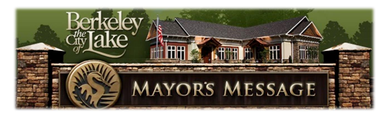
February 25, 2020

As you know from my last Mayor's Message, the Gwinnett County Department of Water Resources is about to begin tearing up South Berkeley Lake Road and later, Little Ridge Road, in order to replace the water main that has been plagued by so many breaks in the recent past. I met recently with a bunch of engineers who are working on the project and they agreed to communicate with me regularly so that I can keep you informed. The road won't be completely closed but there will be delays caused by single lane closures on South Berkeley Lake Road, and later during the project Little Ridge Road may be closed to through traffic. Also, because the water line will be placed under the sidewalk for portions of the project, the sidewalk on South Berkeley Lake Road will be closed at some point and is expected to be closed from that point until the project is completed. They plan to work on the part from Bush Road to Little Ridge Road beginning the week of March 9 and try to finish by the end of May. Then after school is out, they'll continue on Phase 2 south from there. Please see <a href="here">here</a> for more information. They also gave me an email address and phone number for you to use if you have any questions or concerns regarding the project. Feel free to contact them.