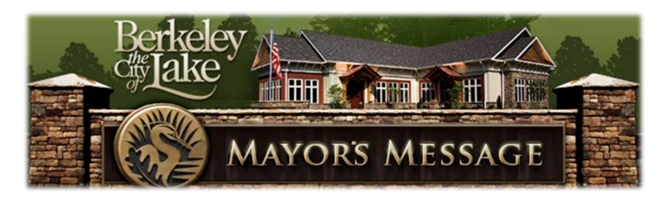
January 31, 2017

As we begin each new year, I appoint members to city committees, and I wanted to thank those of you who give your time to support our community in this way. You might want to thank these people yourself when you see them. All of us are busy and it gets harder and harder to find good volunteers. Their work benefits us all.