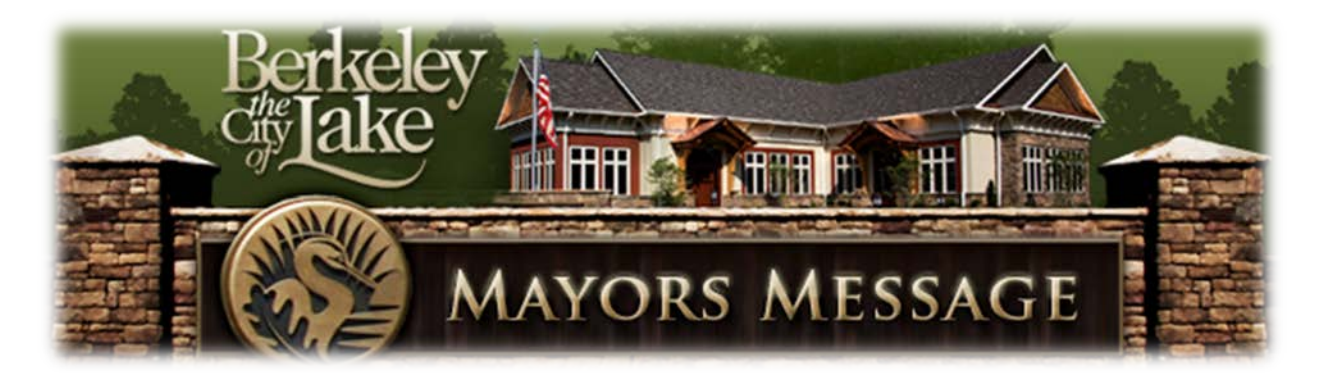
January 9, 2014

You may remember that a year ago I solicited suggestions from our citizens regarding changes they would like to see in our city or concerns they might have. After collecting those, I called a special meeting of city officials and staff for a "visioning session" to share citizen input and discuss actions to take in response. One of those citizen concerns was pedestrian safety along Lakeshore Drive, Ridge, and Little Ridge where there are no sidewalks and the hilly terrain and narrow curving roads make it difficult for drivers to see walkers ahead in many places. In response, the city commissioned a safety study by the Foresite Group, which has some widely respected traffic safety engineers and which gave us the lowest cost proposal to do the work. We have just received the study which, in brief, recommends widening most of Lakeshore by about 4 feet of asphalt pavement extension with striping and 8-inch raised markers. The recommendation for Ridge and Little Ridge is for 5-foot concrete sidewalks with curb and gutters. View Full Report Here. Area homeowners can see in this report exactly what is envisioned for the city right-of-way in front of their property. The project is broken into 6 segments with the engineers' recommended priority order being #3, #4, #2, #1, #5 (Little Ridge Rd), and #6 (Ridge Rd).